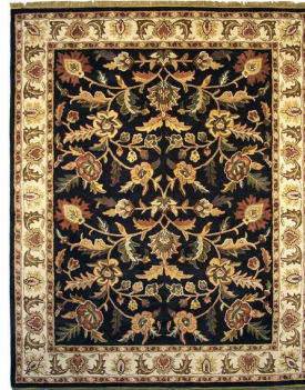
Destin Reno, Nory

Experience the look and feel of a hand-knotted rug for less when you shop hand-tufted rugs at Bliss Carpet Care. Hand-tufted wool rugs are handmade but do not contain individual knots, thus greatly reducing the time to make. Find a diverse selection of hand-tufted rugs and carpets in multiple styles and sizes to suit any home's decor.